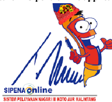
Picture 1. Sipena online application

Apart from being able to access employee attendance, the Nagari Pintar application is called Sipena Online is present in an Android-based service application prepared by the Nagari III Koto Aur Malintang government called. Population session service application or Service Application Governance via Android. and this application can be downloaded via the Play Store, which is useful for the community in administering government and as a panic button service because it can overcome community problems in emergency situations such as: when a problem occurs in the tunnel, the community can press the button as needed because this application is