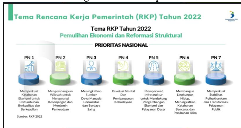
Figure 6. The theme of the government work plan (RKP) for 2022