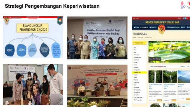
Figure 3. Tourism development strategy