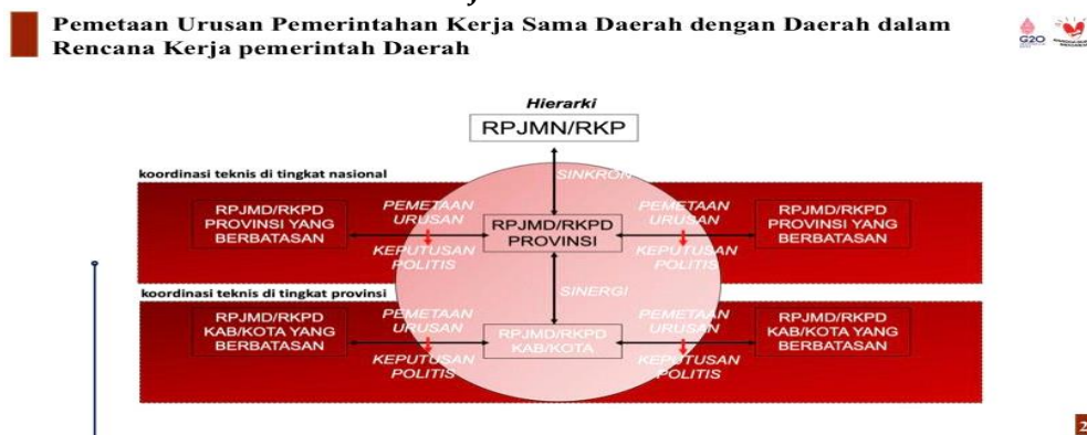
Figure 7. RPJMN/RKP 2022