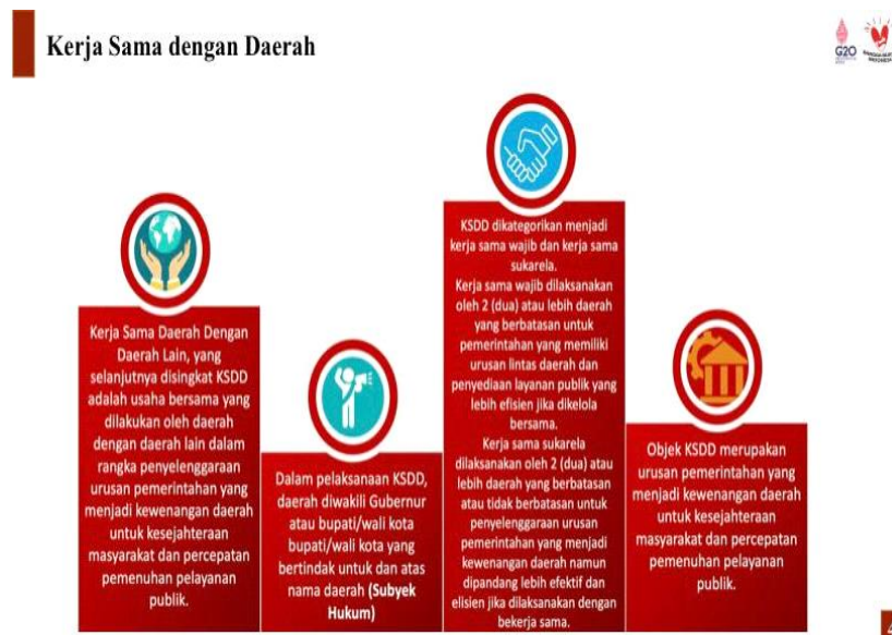
Figure 2. Cooperation with the regions