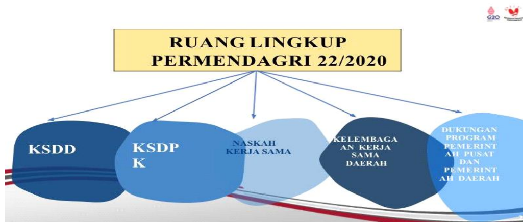
Figure 1. Permendagri Number 22 of 2022