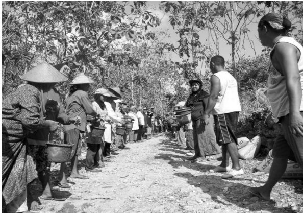
Picture 3. Implementation of Road Construction in Dlingo Village