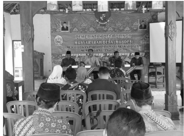
Picture 2. Implementation of Village Consultation in Dlingo Village

Source: Dlingo Village Website ( http://dlingobantul.desa.id/index.php/first/musdesbpd )