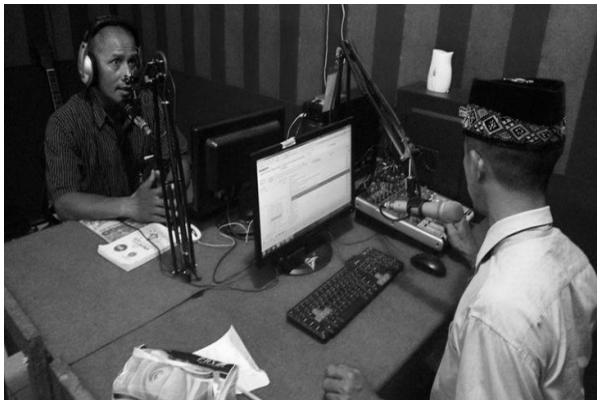
Picture 4. Dlingo Village Community Radio

Source: Dlingo Village Website ( http://dlingo-bantul.desa.id )